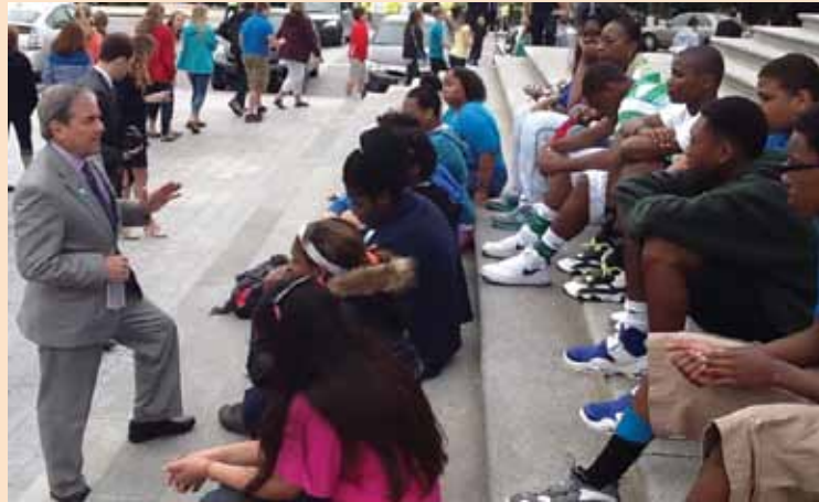
Congressman Yarmuth meets and speaks with eighth grade Nativity students on the steps of the Capitol Building.