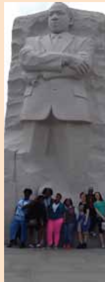
Nativity students gather at the base of the Dr. Martin Luther King, Jr. Memorial statue.