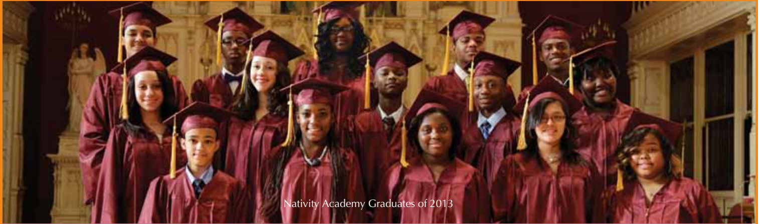
Nativity Academy Graduates of 2013