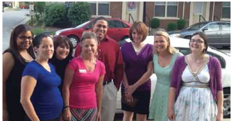
Nativity faculty and staff gather at St. Boniface to attend graduation ceremonies.