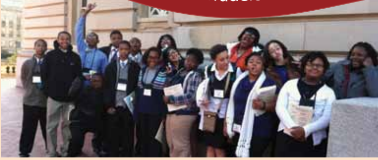
Nativity eighth grade boys and girls gather for a photo during their tour of the historical and educational national sites in Washington DC.