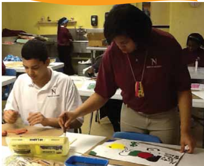
Extended Day Program offers our students art activities for personal expression and creative development.