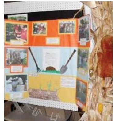
For the recent Festival of Faiths in Louisville, Nativity students created this tri-fold exhibit that displays Nativity's partnership with the Billy Goat Hill Community Garden.