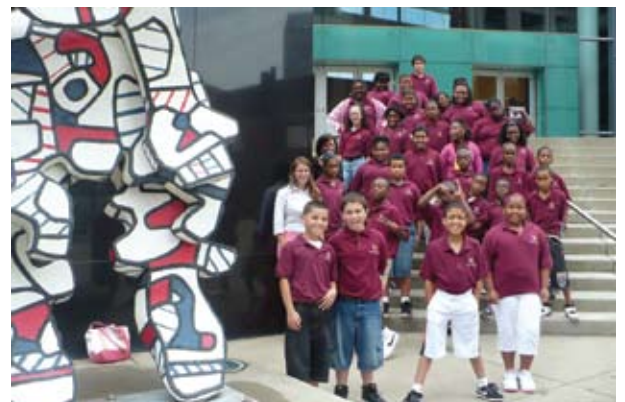
6th graders stand outside the Kentucky Center for the Arts for their end of the summer field trip.