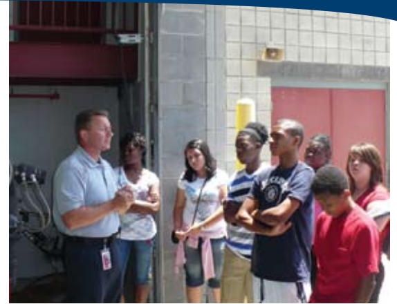
8th graders visit the Police/Fire station at the Louisville International Airport for a summer session field trip.