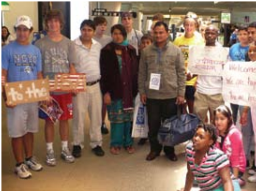
7th graders welcome newly arriving refugees at the airport as a part of their Summer Peace Program service learning with Catholic Charities Refugee Ministry.